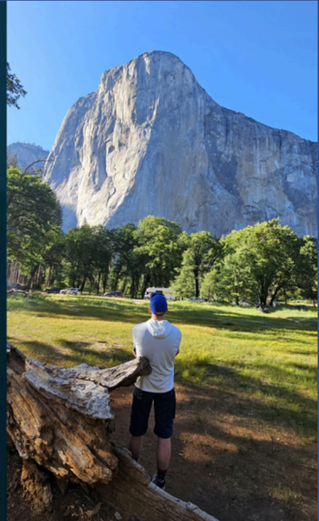
El Capitan - Yosemite Valley, California