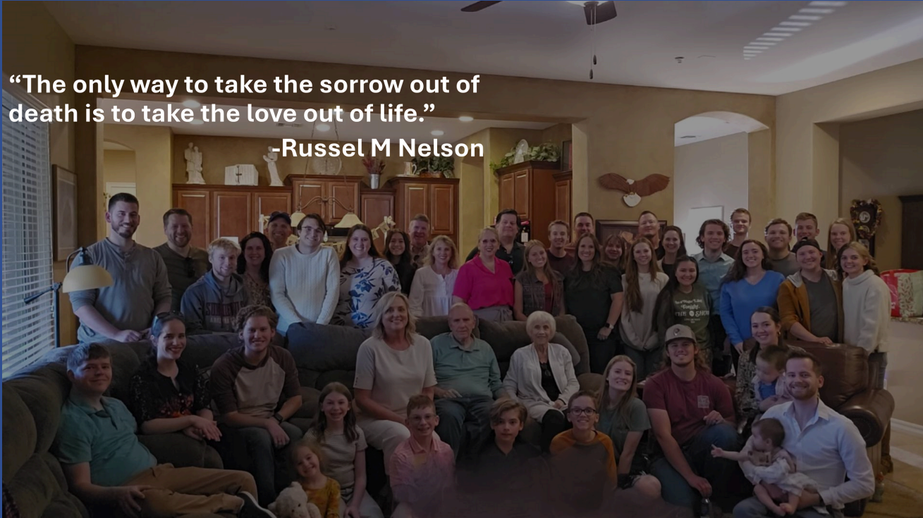
Thanksgiving Family Picture