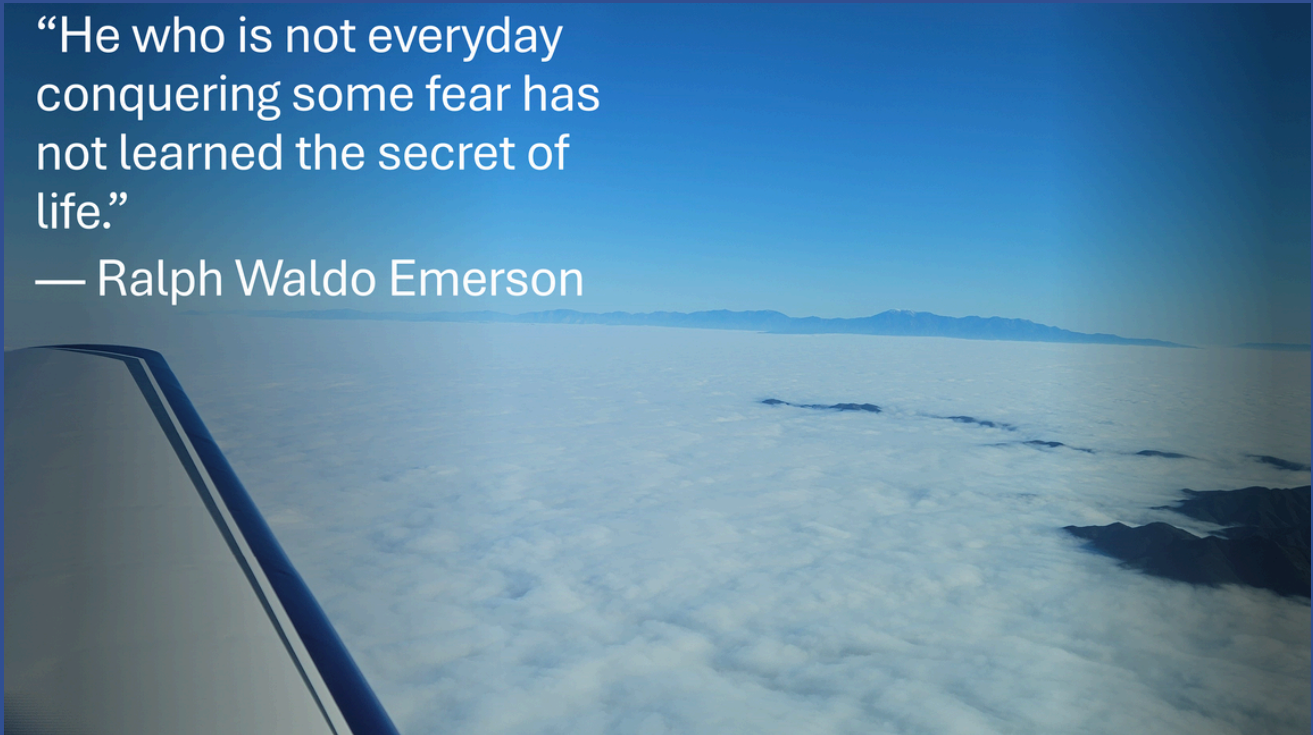
Santiago Peak - California