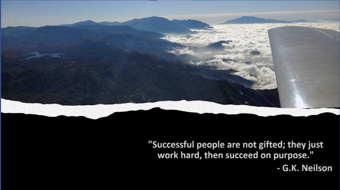
Lake Arrowhead - San Bernardino Mountains